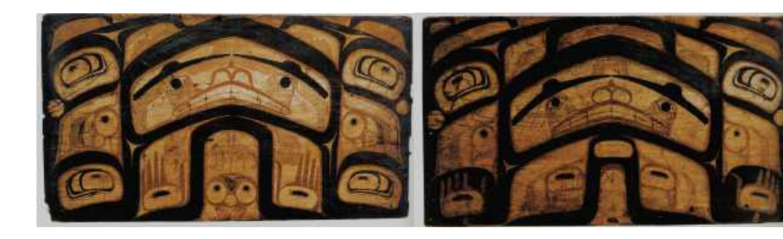
Two chest panels illustrated in Native Visions, from a private collection.

An additional example of this artist's work is recorded on the Burke Museum photo videodisk, from an unknown private collection, frame #23185. A closely related work, though probably by a different artist, is in the American Museum of Natural History [16/4969] also on the videodisk.