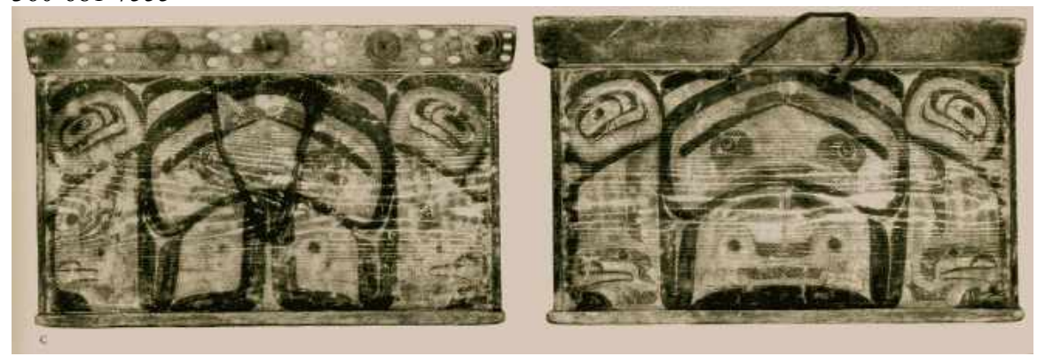
Painted chest now in the Royal British Columbia Museum, Victoria.