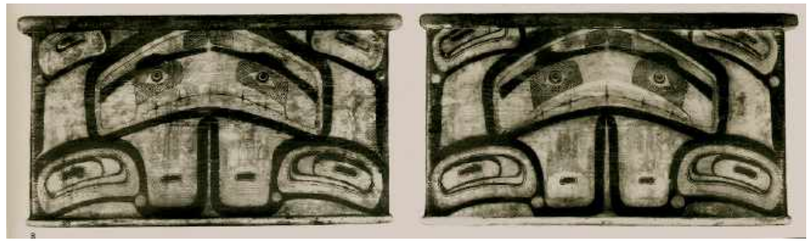
Two sides of a painted chest, now in the Glenbow Museum in Calgary, Alberta.