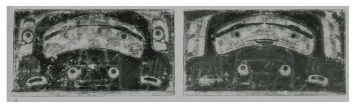
Painted chest attributed to this artist, now in the art museum at UCLA.

Of these, I would attribute the Glenbow and the RBCM chests to the earliest period in this artist's series of innovative works, and the UCLA chest to the latest period of work, one that perhaps closely followed the creation of the Koksilah chest. The subject example would best fit in the middle of these two periods, as it shows somewhat equal ties to both the earlier and the later attributed examples. (The artist may well have spent the very earliest part of his career painting wholly conventional chest designs, only moving into these more innovative styles after a time of apprenticeship.)