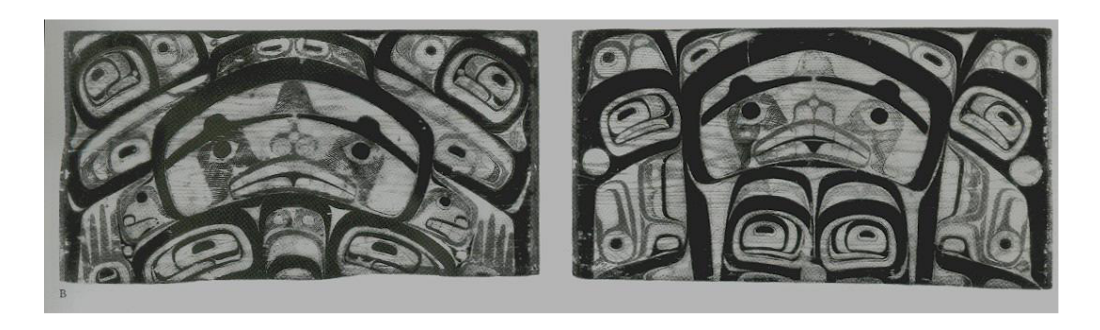
Elaborate chest painting now in the British Museum, London.

Another chest painting illustrated on the same page [fig. 6.26B] is more closely related to the work on the previous chests, and may with more certainty be by the same painter. It is identified by the authors in that case as being of Tsimshian creation (not Heiltsuk as attributed to the others). That chest is in the British Museum [AM 1976.03.40a-d], and was originally collected on Haida Gwaii, the Queen Charlotte Islands.